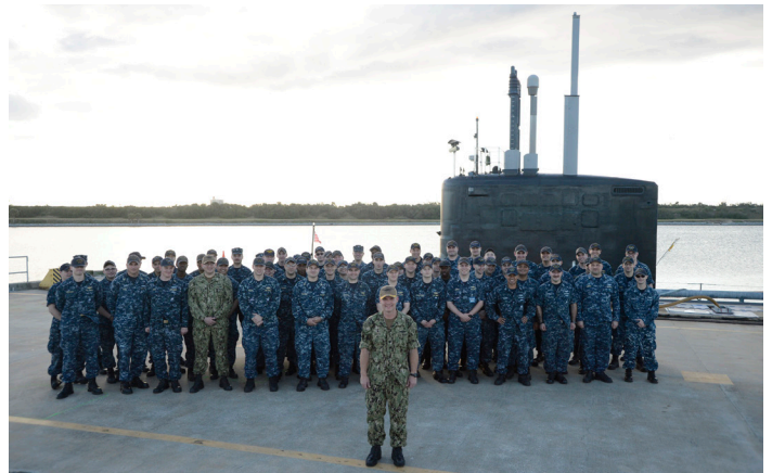
PORT CANAVERAL, Fla. (January 12, 2018) Officers and crew assigned to PCU Colorado (SSN 788) post for a group photo.